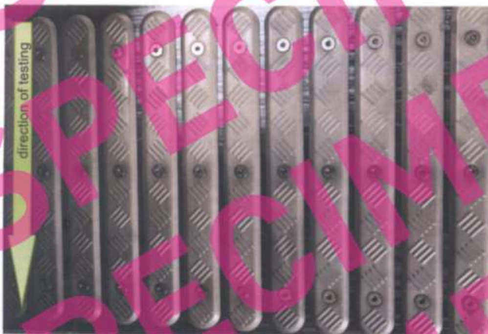
Foto 1.: VZ030 21 0510 - GUIDE tactil paths from stainless steel with relief – 300x35x5 mm

The results apply to the sample as received.